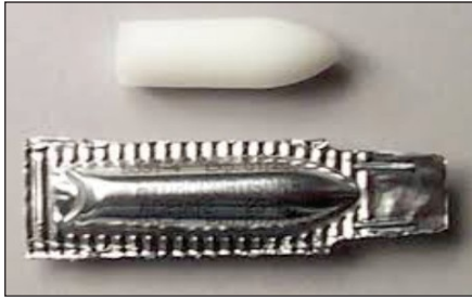
Figure 4-Rectal suppository