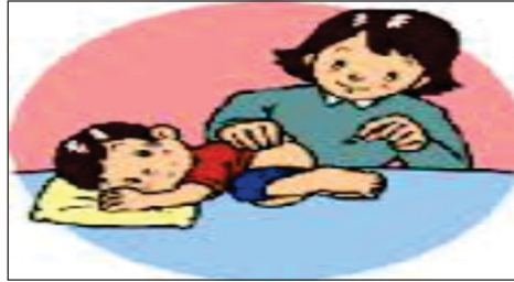
Figure5:A Mother giving rectalsuppository to her child