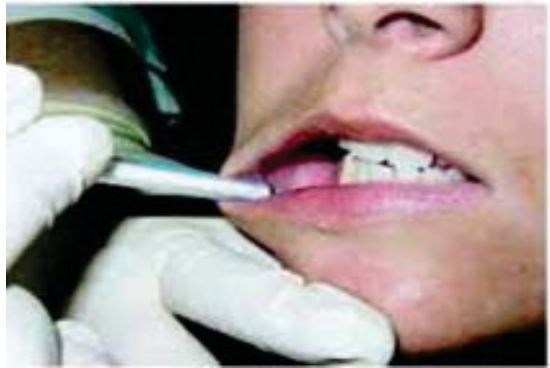
Figure 3: Buccal midazolam