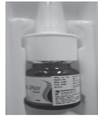
Figure 2a.- Nasalspray